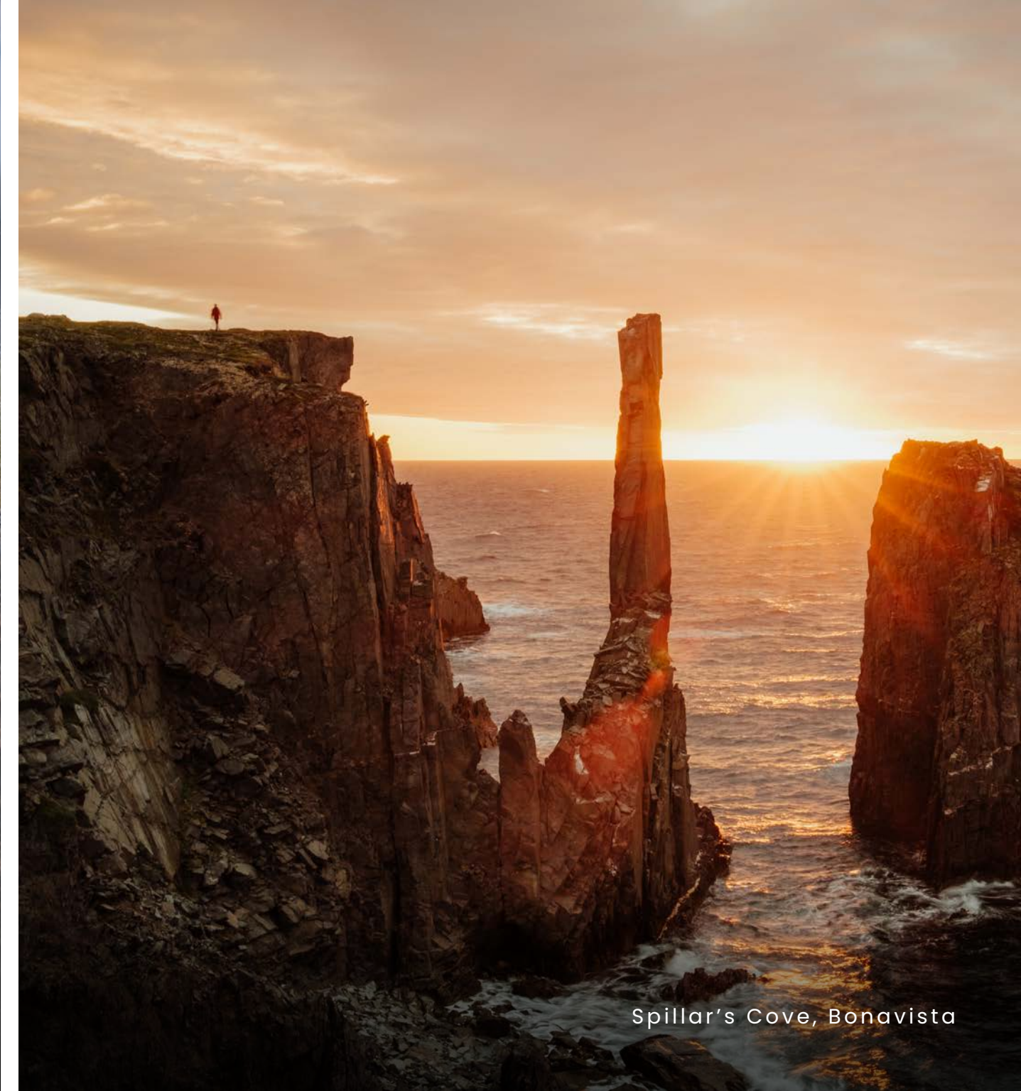
Spillar's Cove, Bonavista