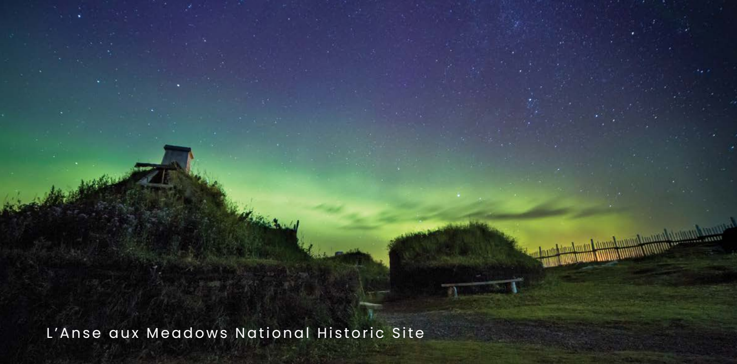
L'Anse aux Meadows National Historic Site