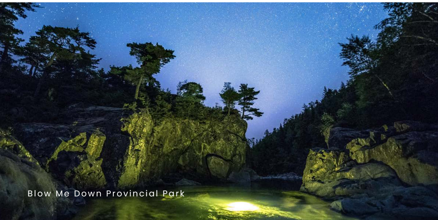
Blow Me Down Provincial Park