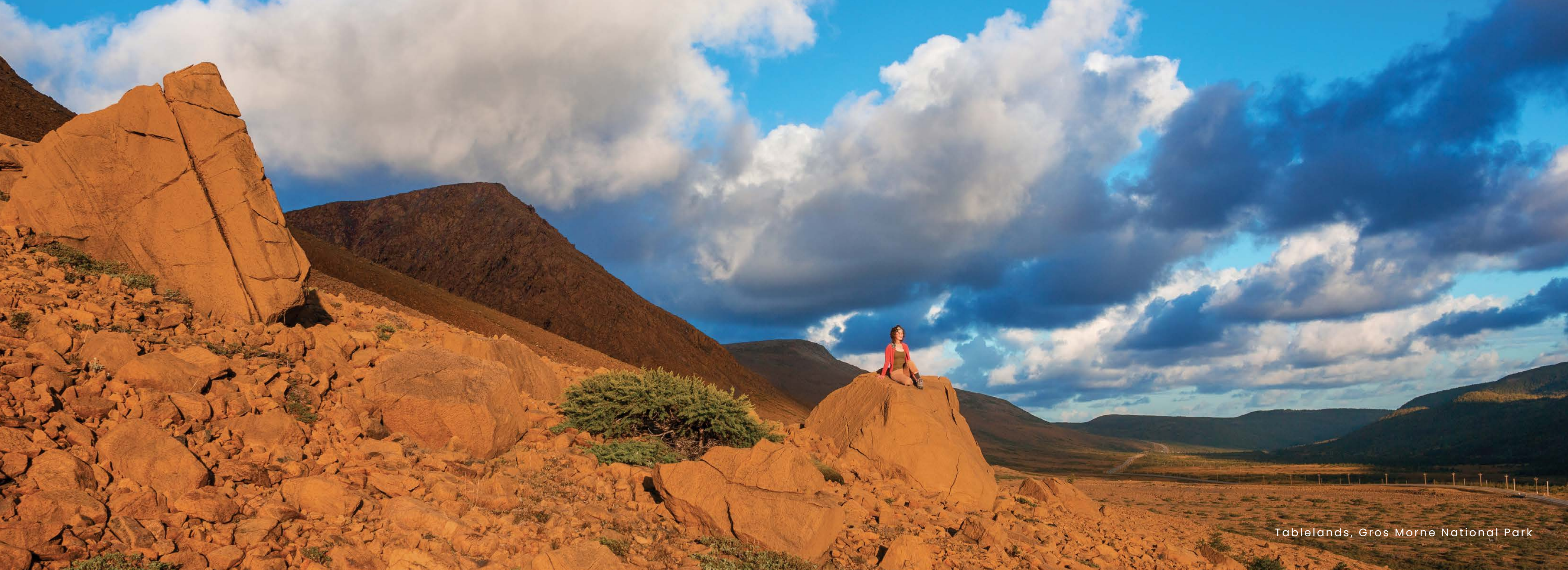
Tablelands, Gros Morne National Park