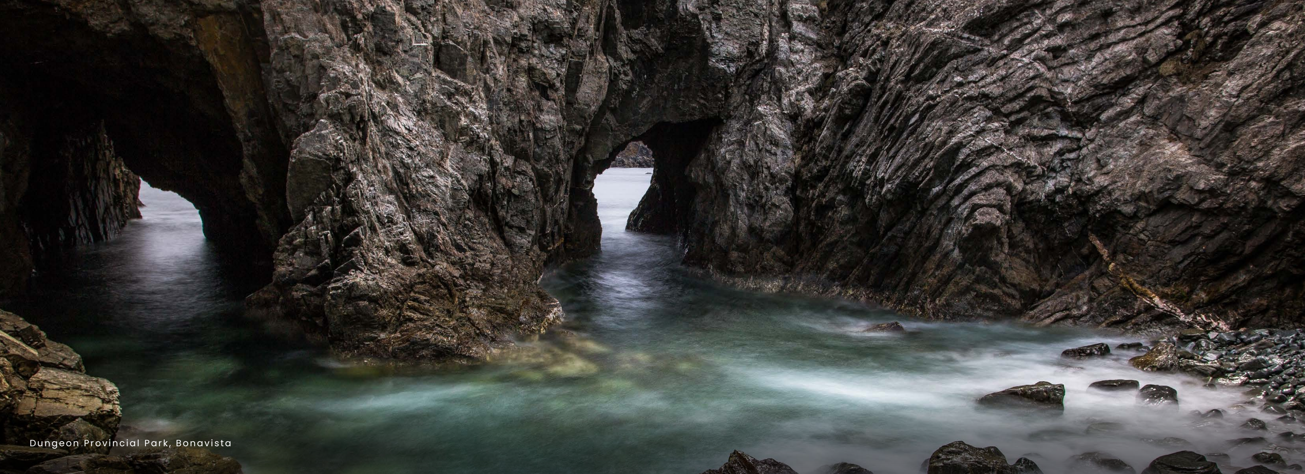
Dungeon Provincial Park, Bonavista