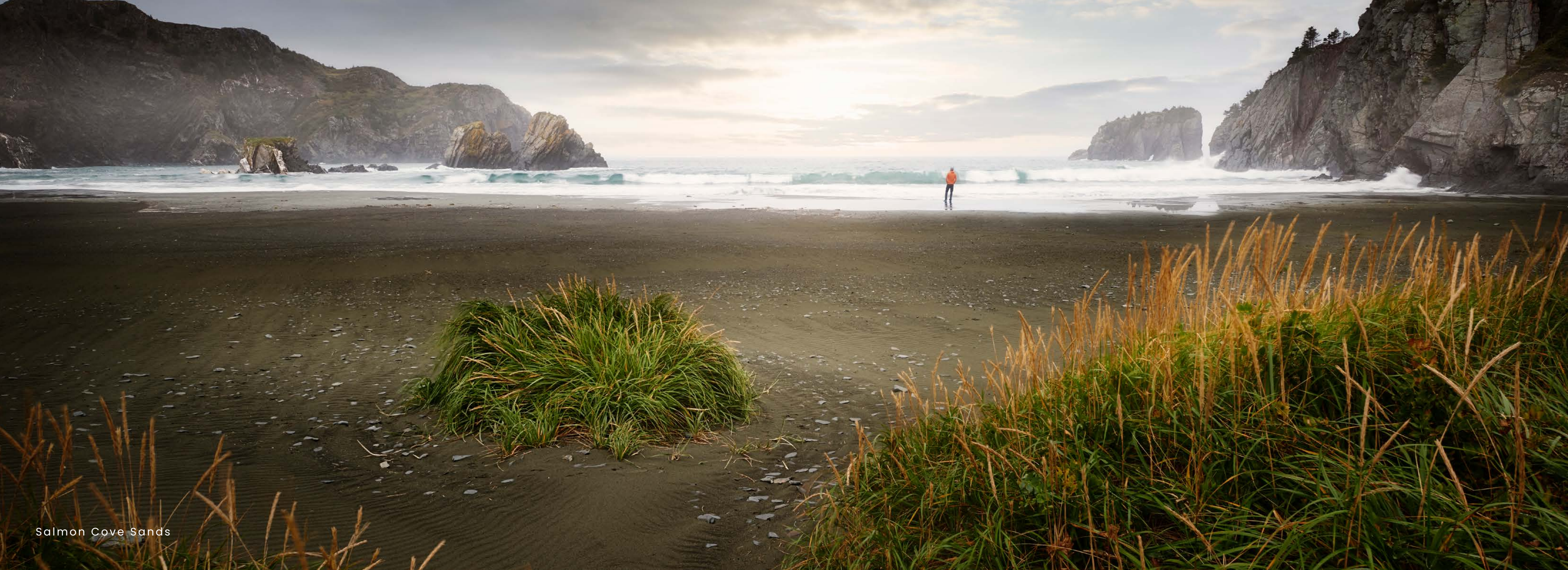
Salmon Cove Sands