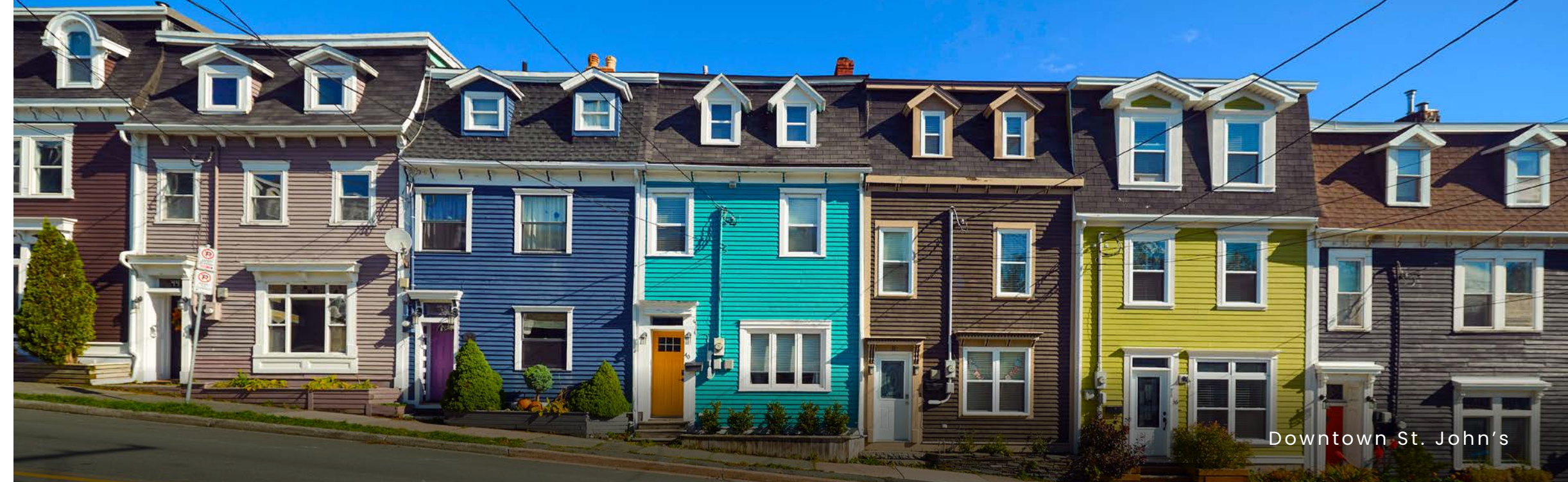
Downtown St. John's