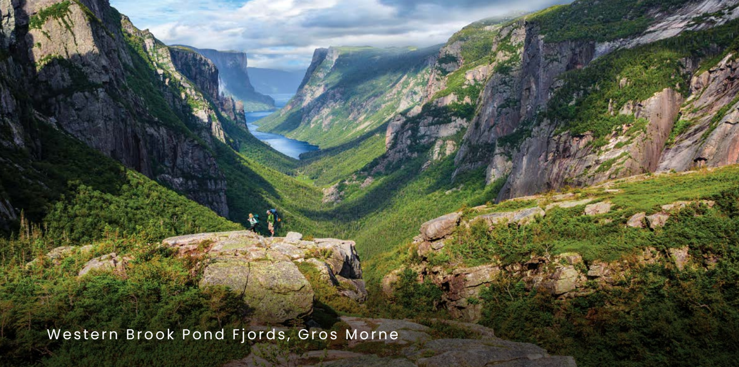
Western Brook Pond Fjords, Gros Morne