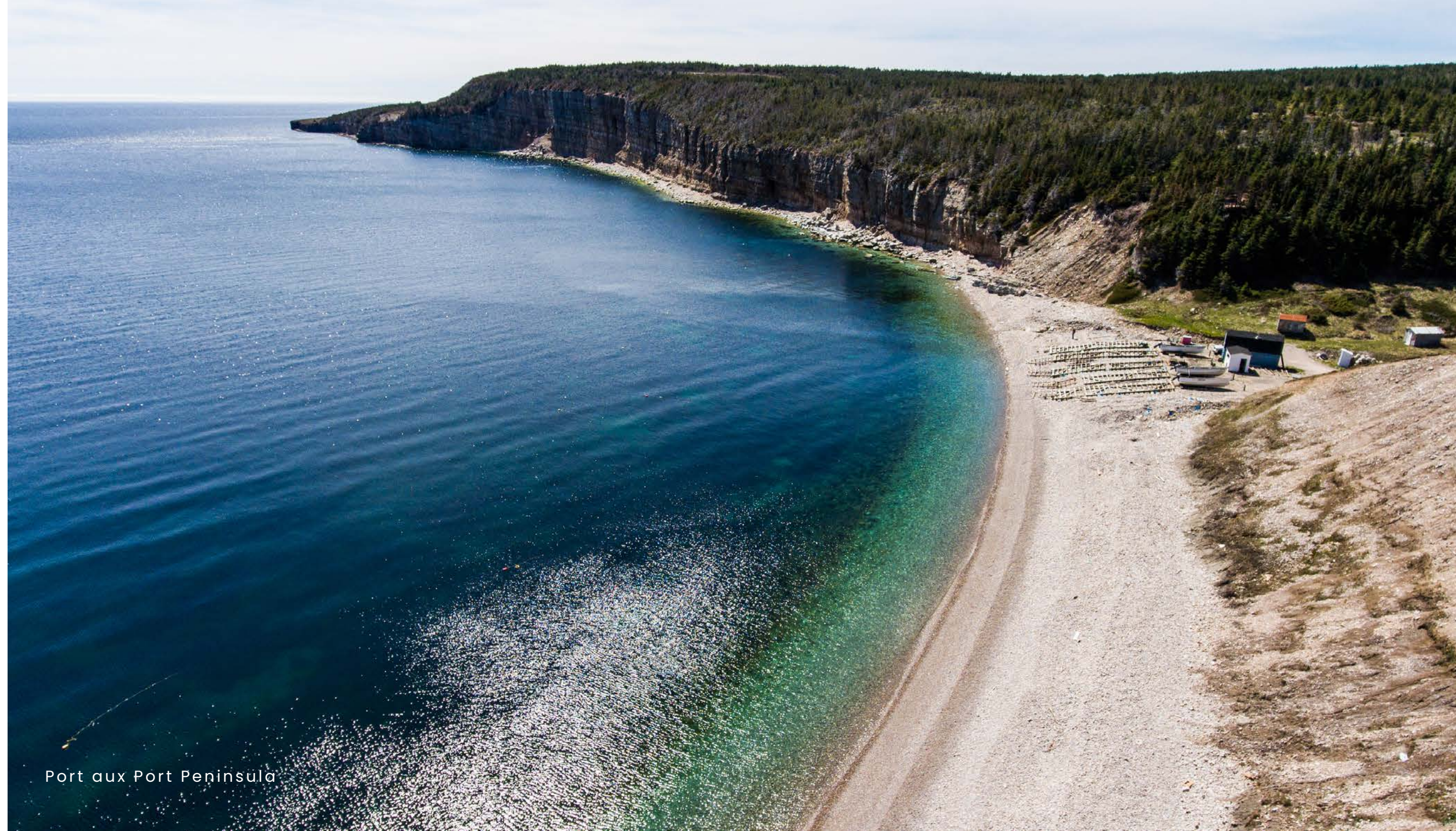
Port aux Port Peninsula