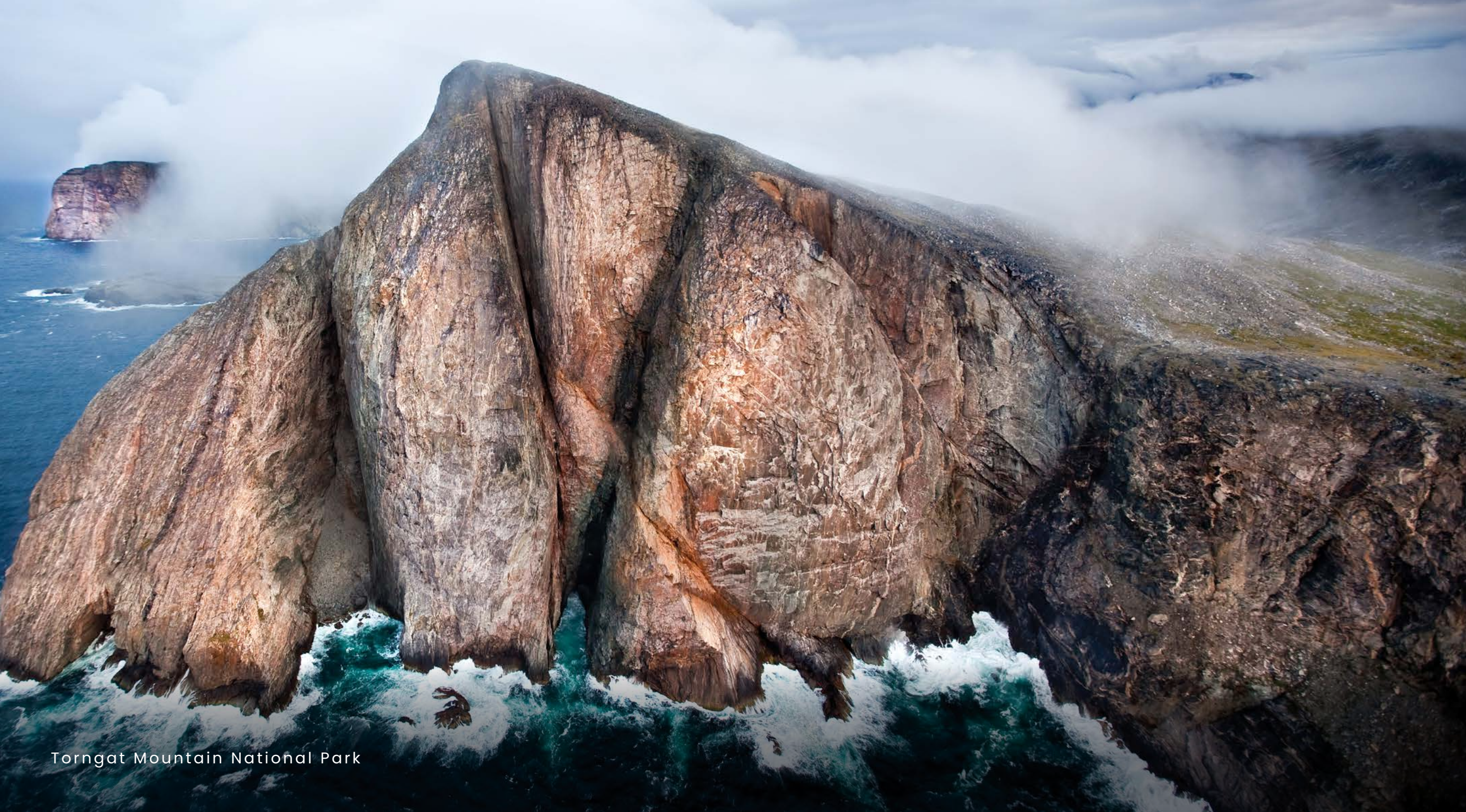
Torngat Mountain National Park