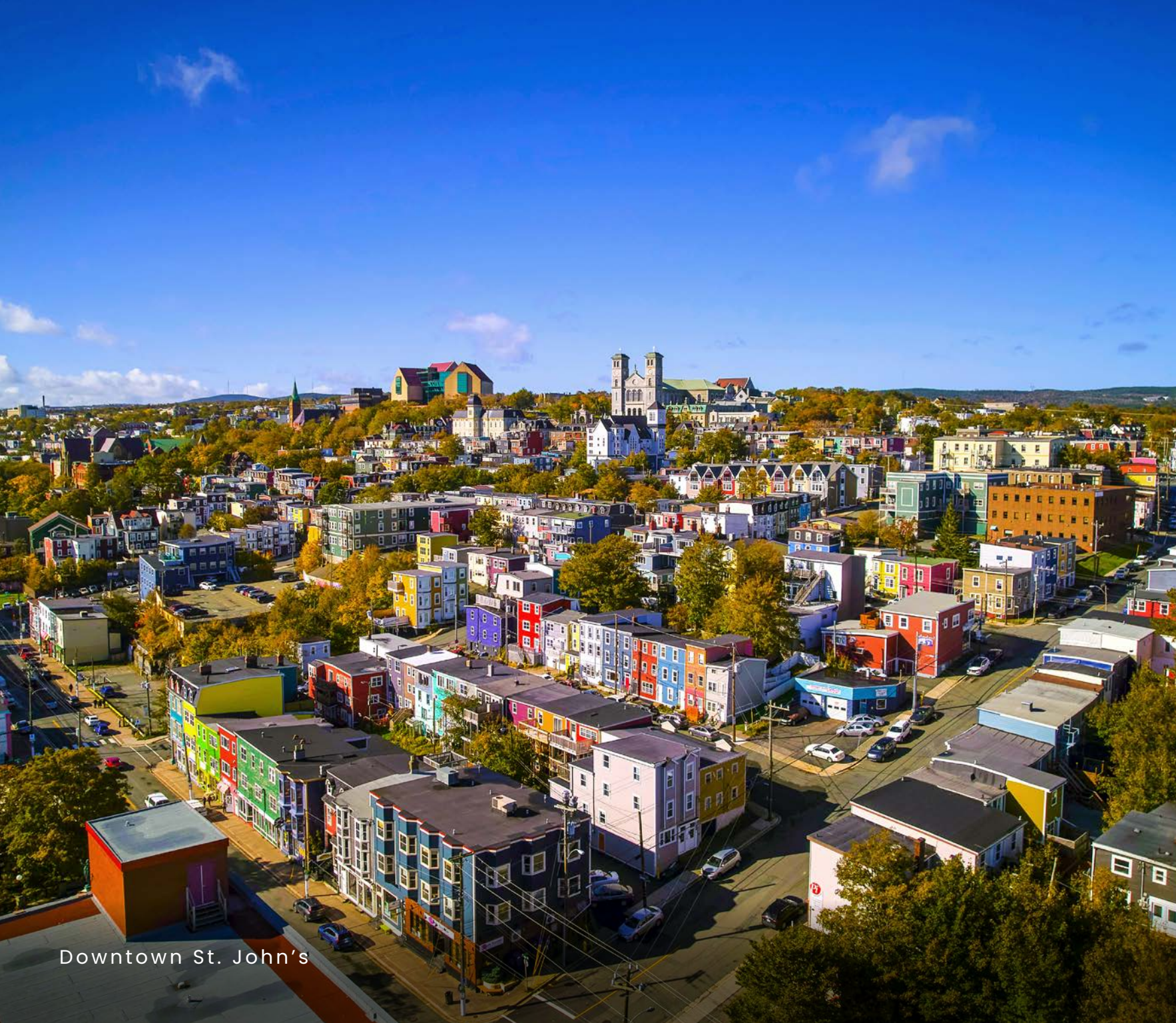
Downtown St. John's