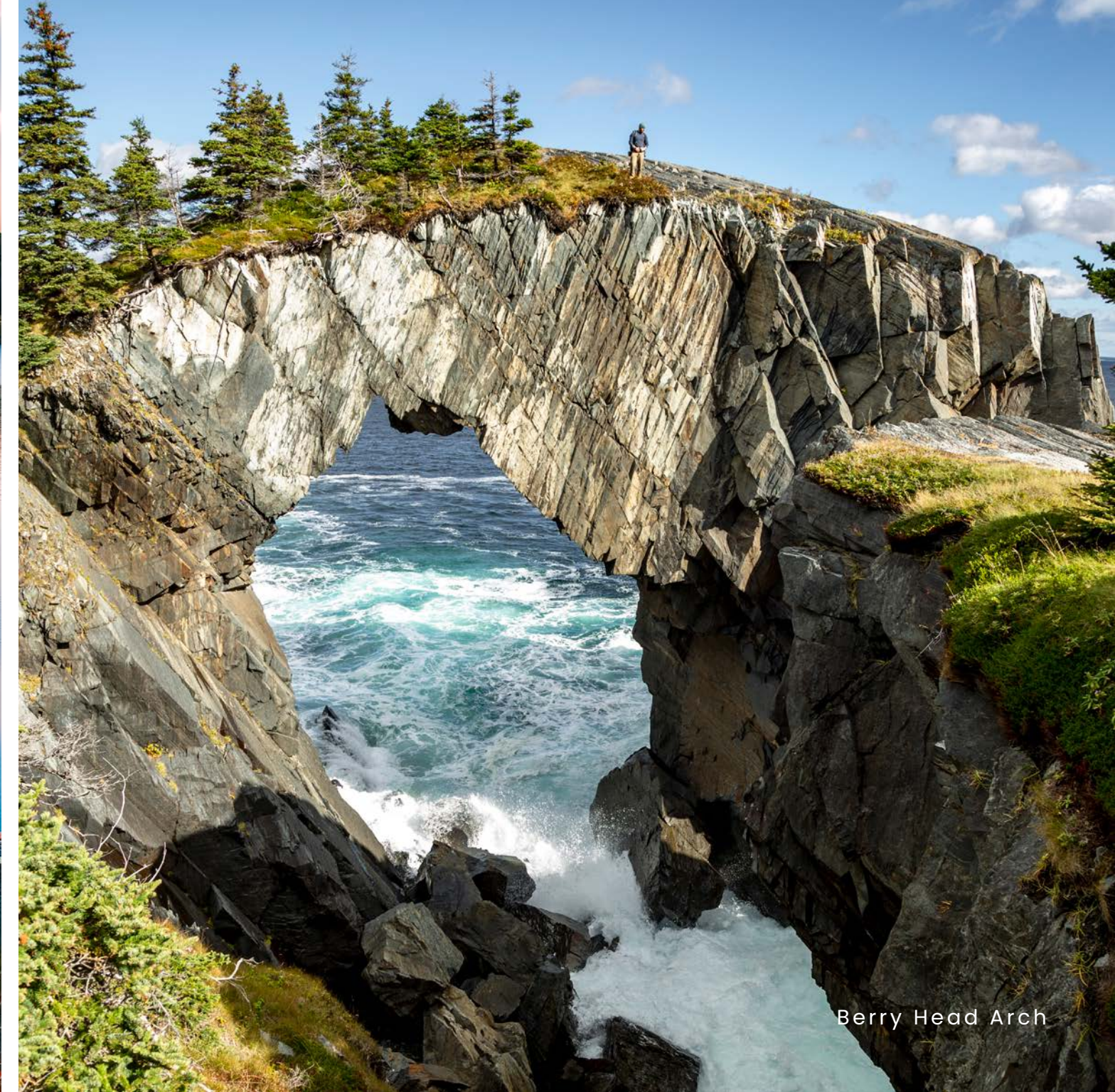
Berry Head Arch