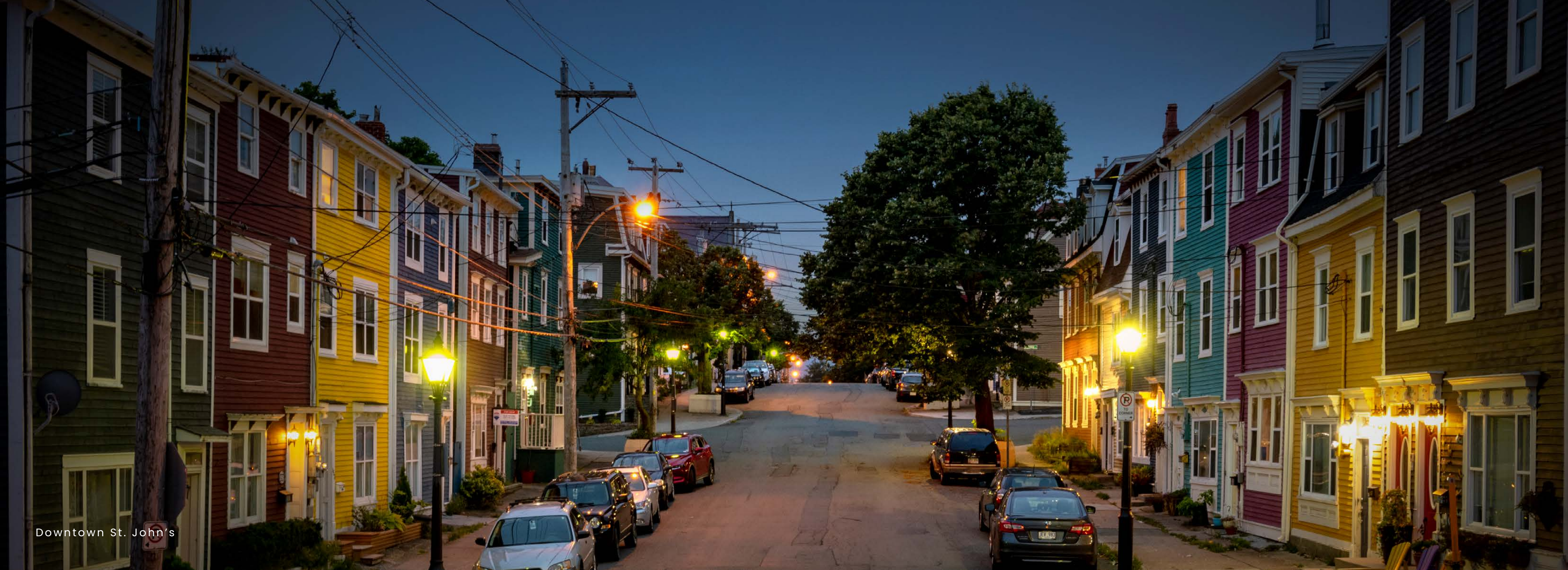
Downtown St. John's