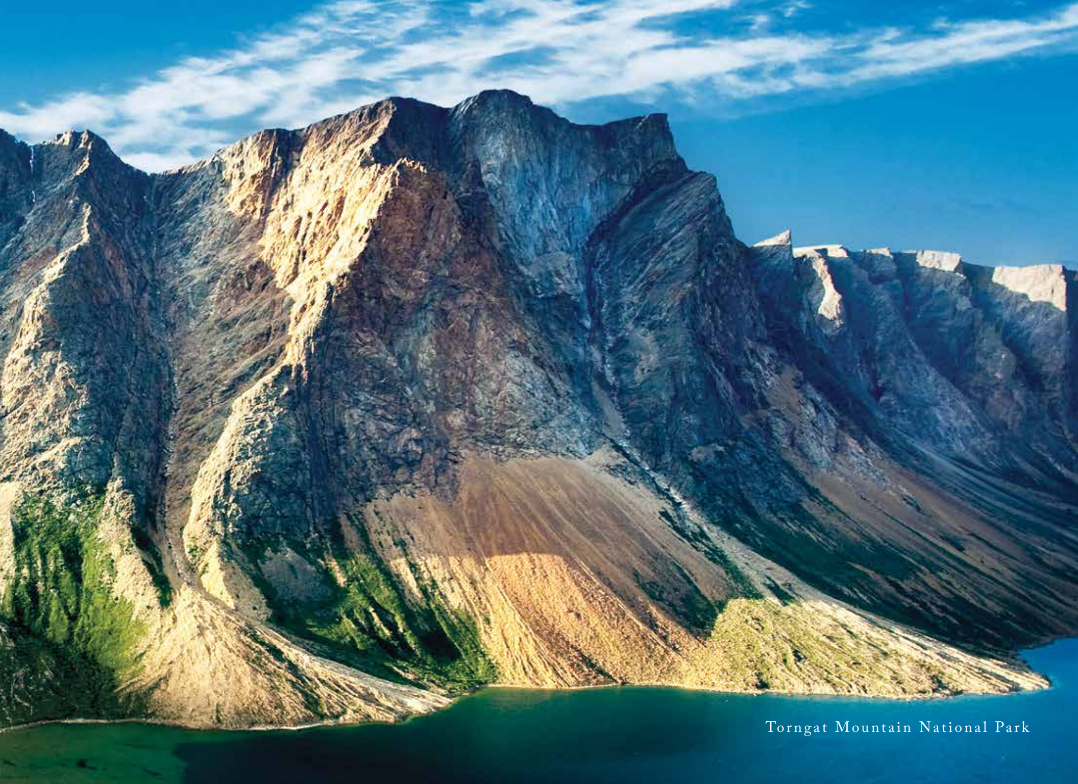
Torngat Mountain National Park