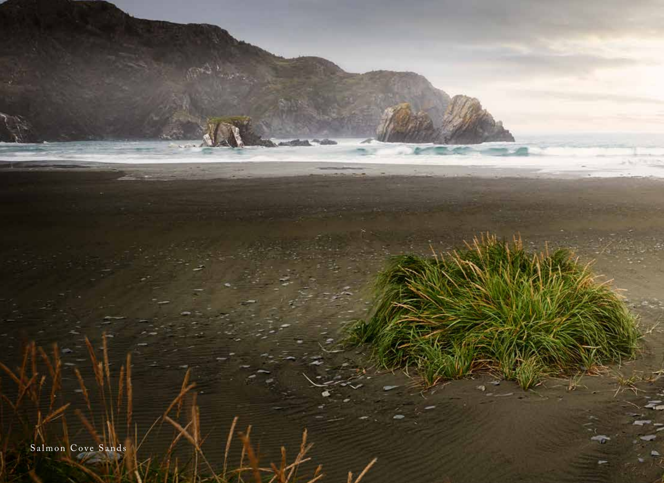
Salmon Cove Sands