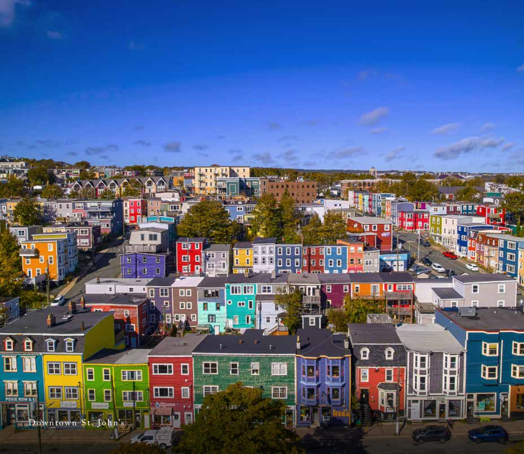
Downtown St. John's