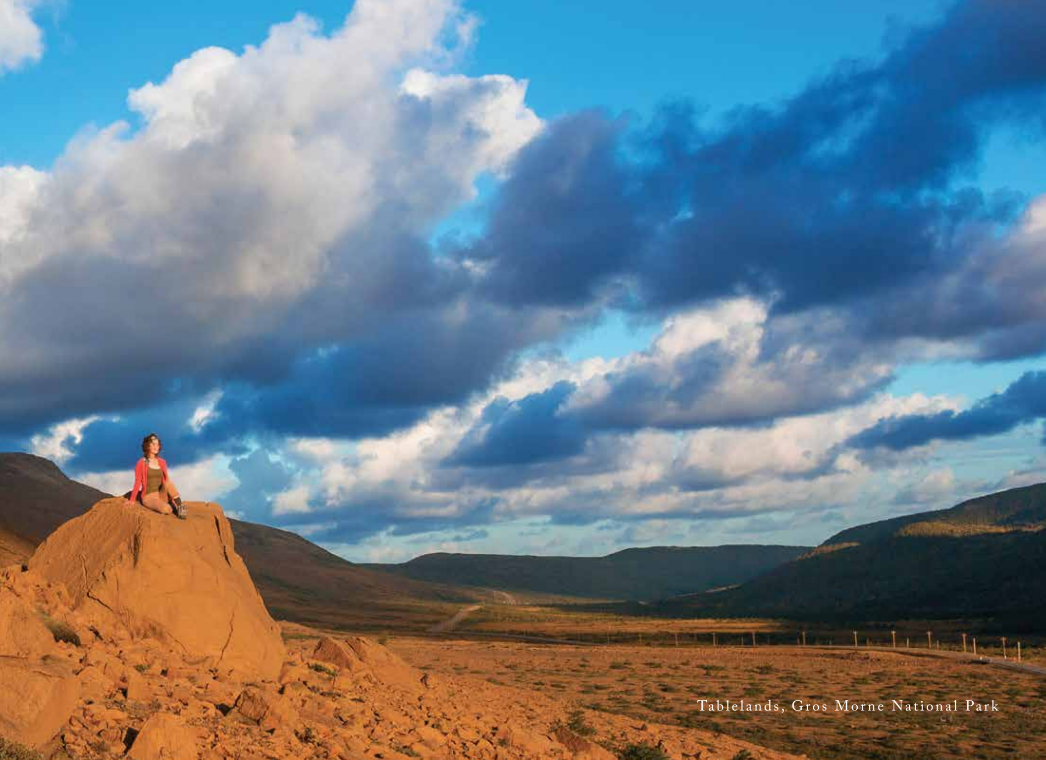
Tablelands, Gros Morne National Park