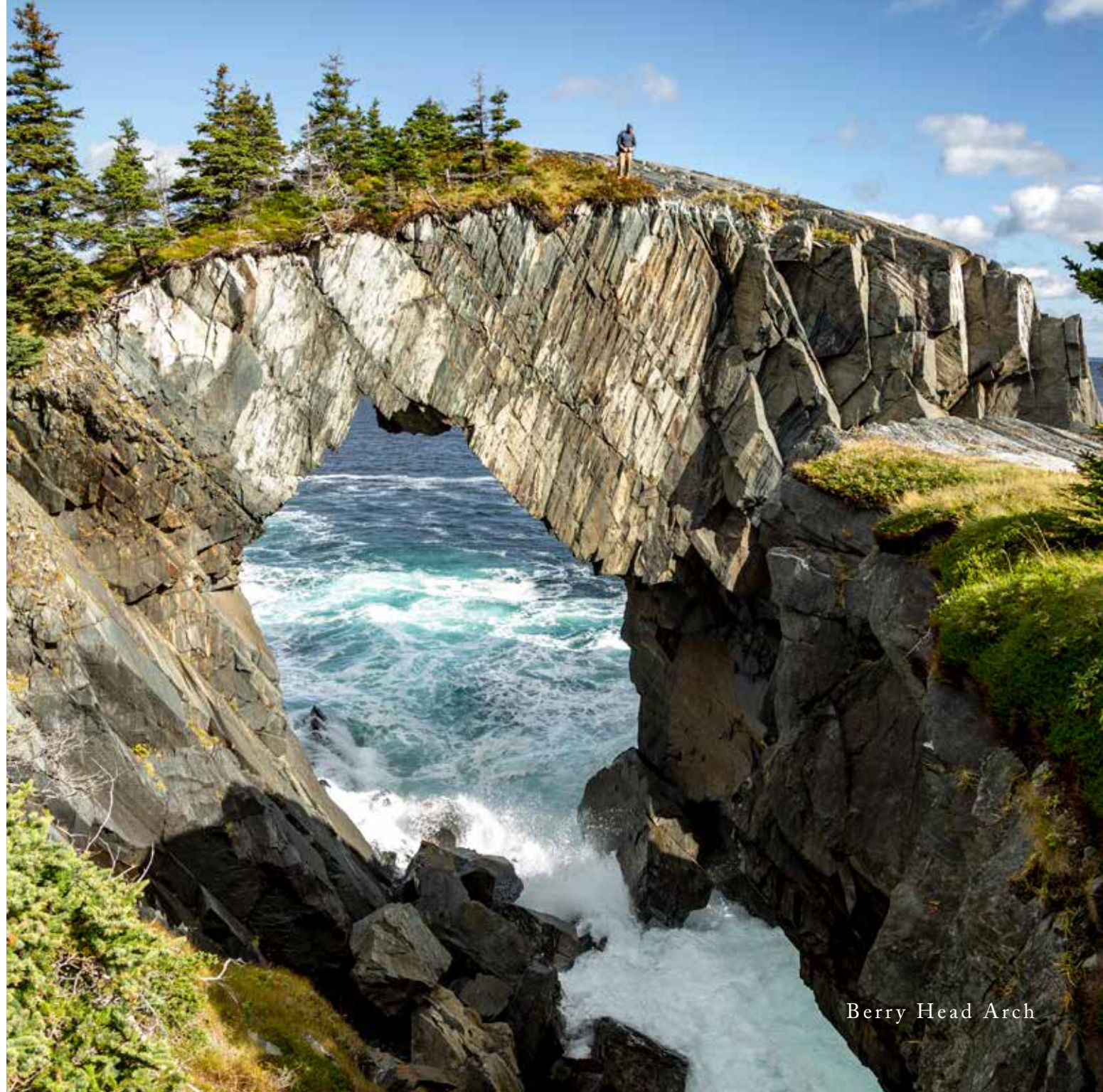
Berry Head Arch