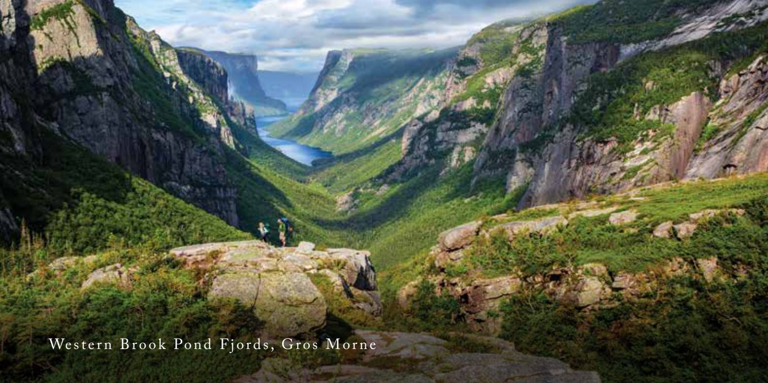
Western Brook Pond Fjords, Gros Morne