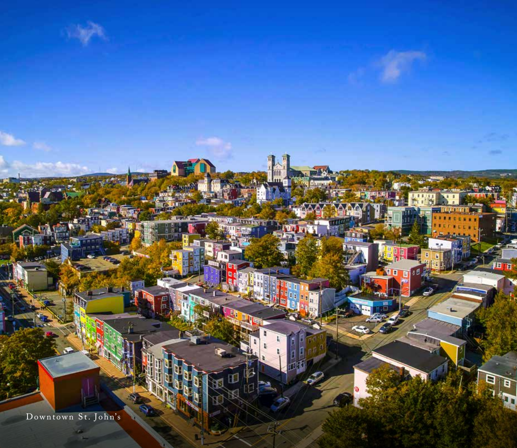
Downtown St. John's