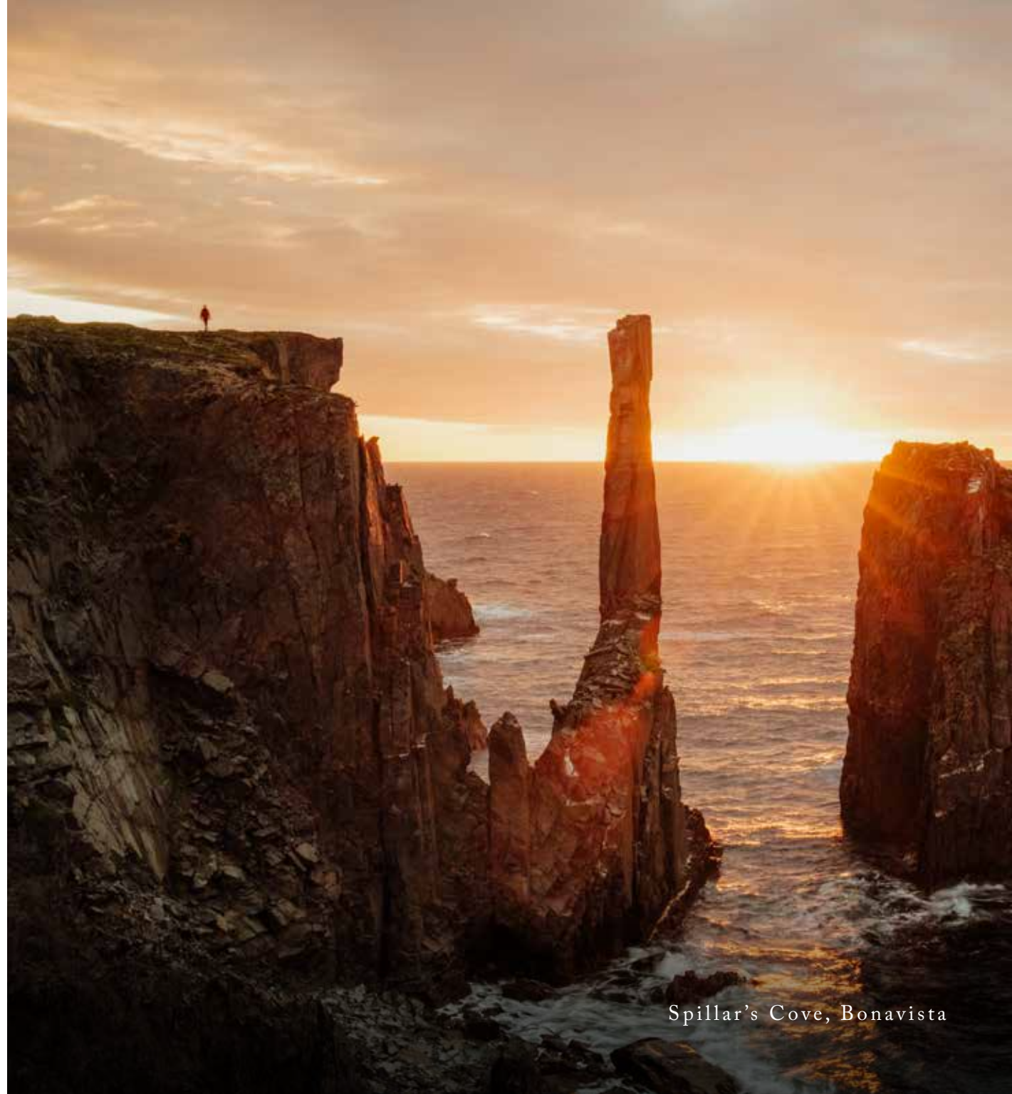
Spillar's Cove, Bonavista