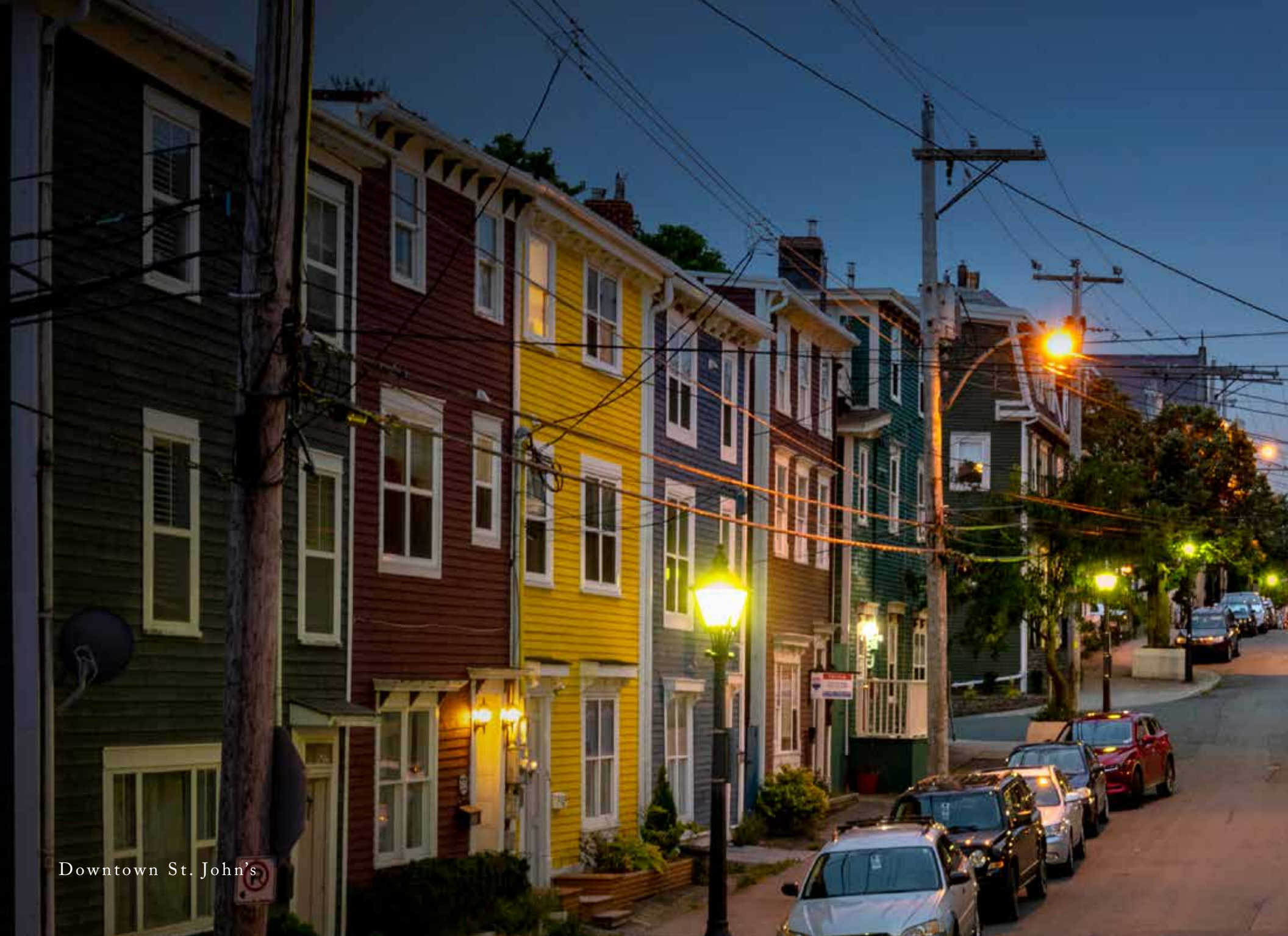
Downtown St. John's