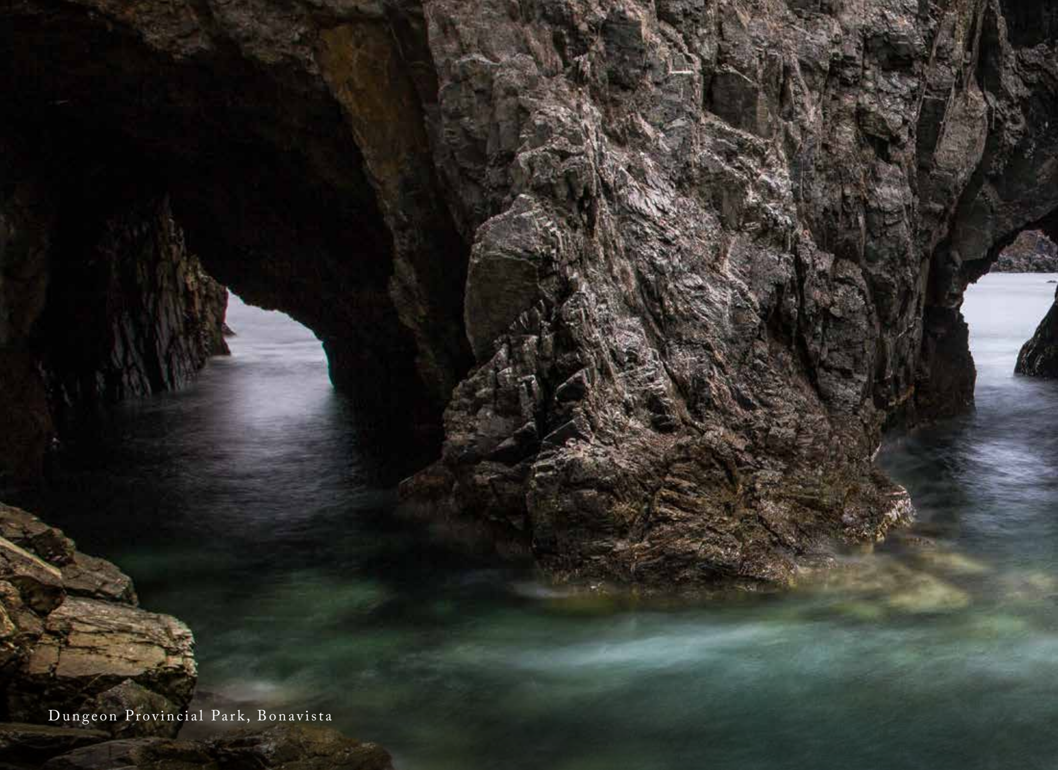
Dungeon Provincial Park, Bonavista