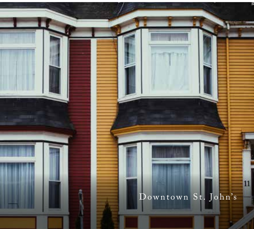
Downtown St. John's