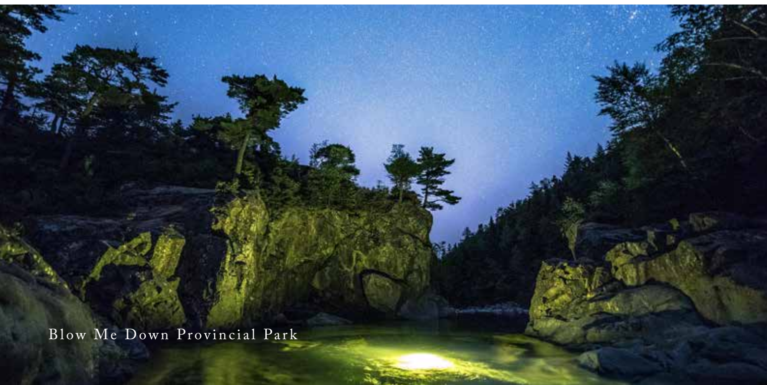
Blow Me Down Provincial Park