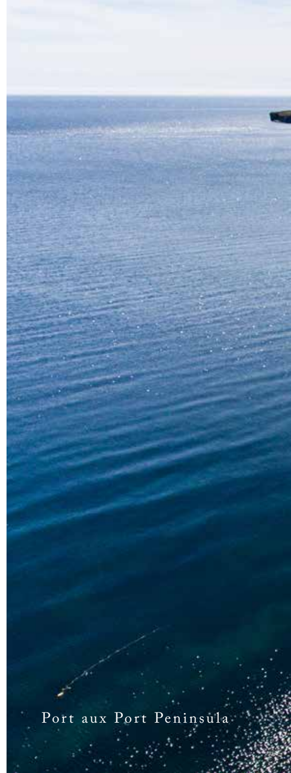
Port aux Port Peninsula