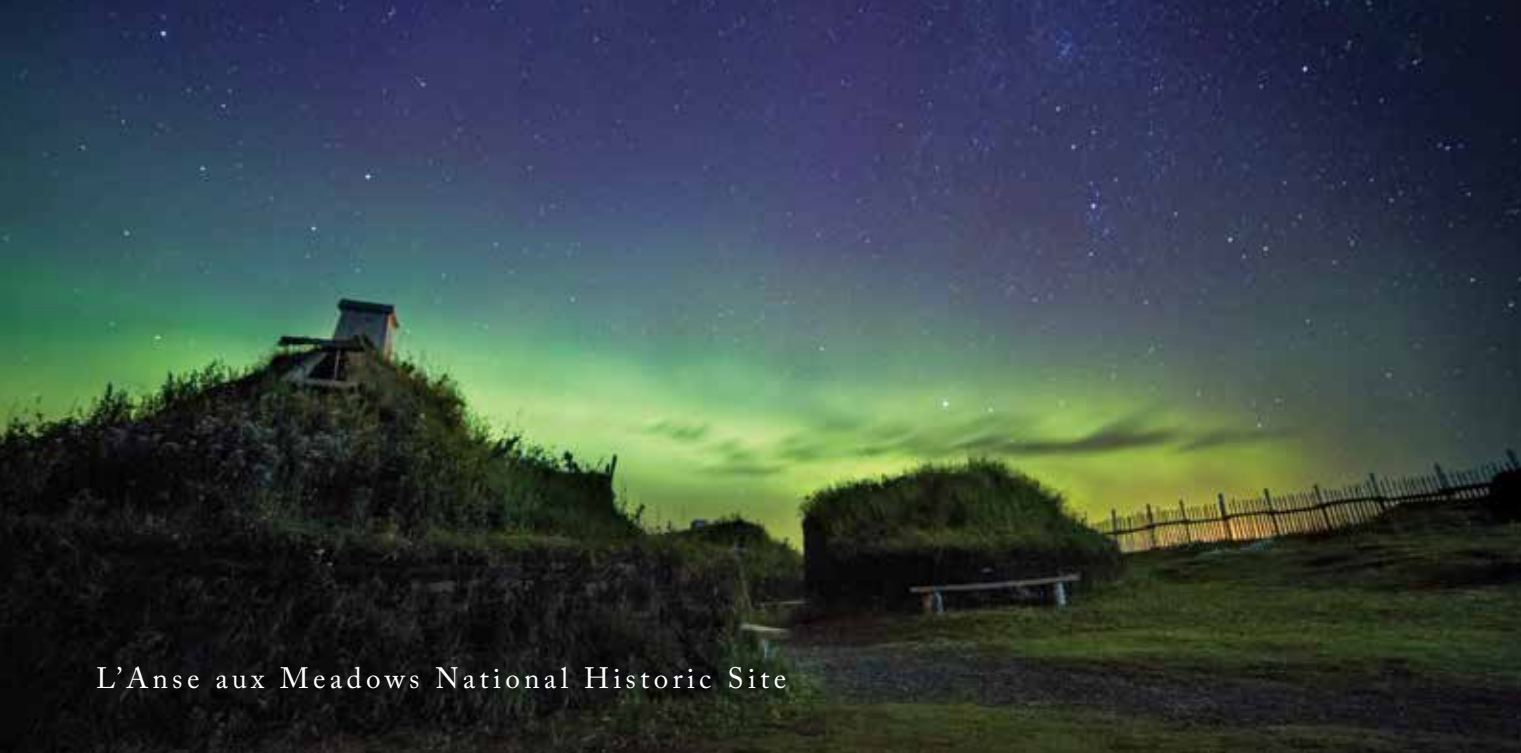
L'Anse aux Meadows National Historic Site