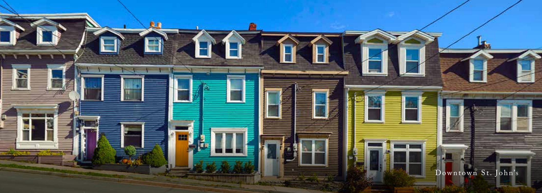
Downtown St. John's