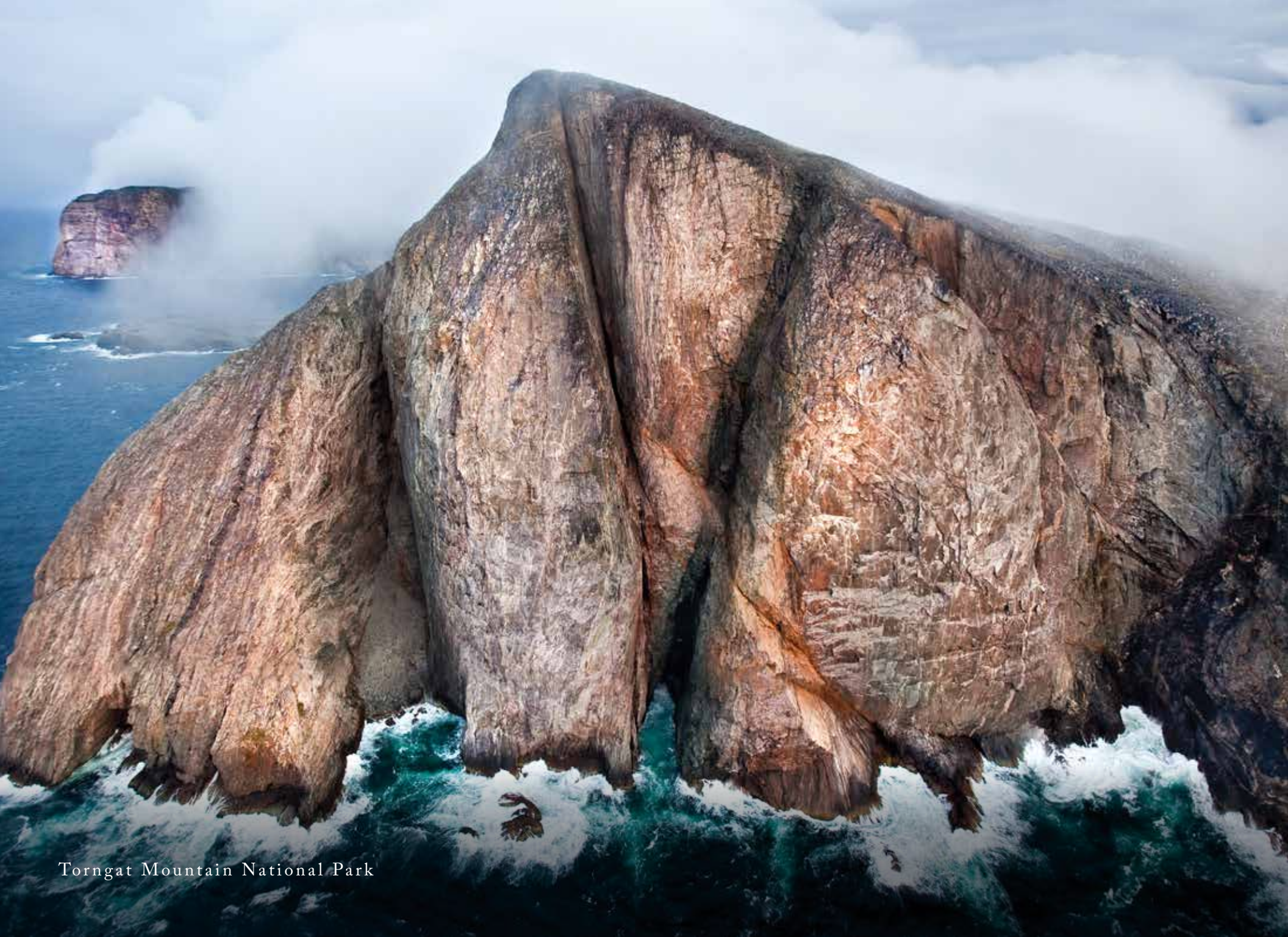
Torngat Mountain National Park